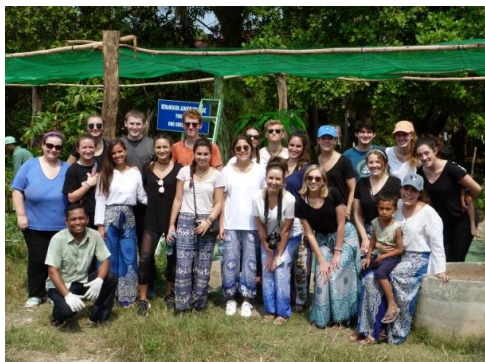
Me and my SASers

Most of these activities took place with students dressed in the new SASer uniform of elephant pants (wide leg trousers with elastic bottoms made from materials covered in elephant prints!) bought in the markets of Siem Reap and Ho Chi Minh city!