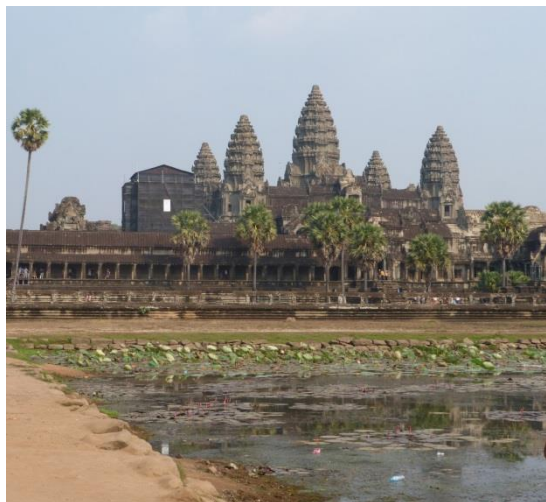
Angkor Wat, Cambodia

Plus it's Tet – so millions are travelling – mostly on Chinese made scooters with their whole family (I saw 5 on one), plus luggage – all on one bike. I even saw someone transporting a large fridge in the box on the back of one. A fridge! I can't even think of the logistics of how you actually get it on the bike, stay upright and drive.