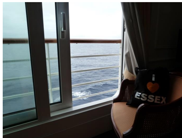
My new reading spot – a chair next to my cabin window, en route to Hawaii

I have found the various corners of the ship where I will sit and work on my research papers, and already had some amazing conversations with all the different types of faculty that are here.